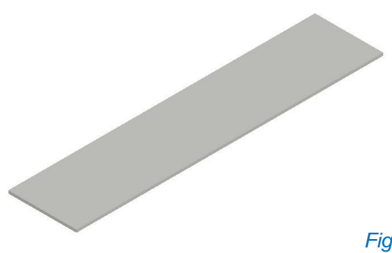
Figure 1 Timber shelf x 5, contact Keylar for Steel shelves