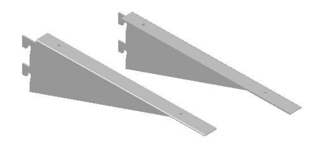
Figure 3 Brackets x 20