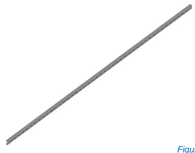
Figure 2 wall strips x 4